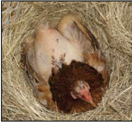
After using the Hen Saver® aprons, the hens went from looking ready for the pot to looking like they had never lost a feather.