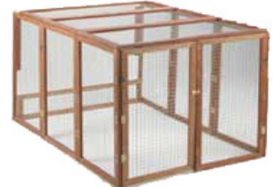
40" x 60" x 36" High

Critter-Cages.Com 305 N. Harbor Blvd. San Pedro, Ca. 90731