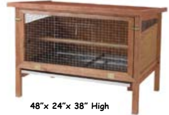
48" x 24" x 38" High

Chick-N-Nest-12.99 WA 01492 *plus shipping