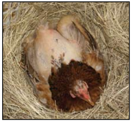
After using the Hen Saver® aprons, the hens went from looking ready for the pot to looking like they had never lost a feather.